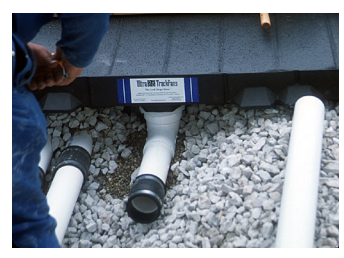
All Center and Side Track Pans are molded with pipe fitting locators at their lowest point. Below-grade piping can be installed to channel large spills to oil/water separators, holding ponds, etc.